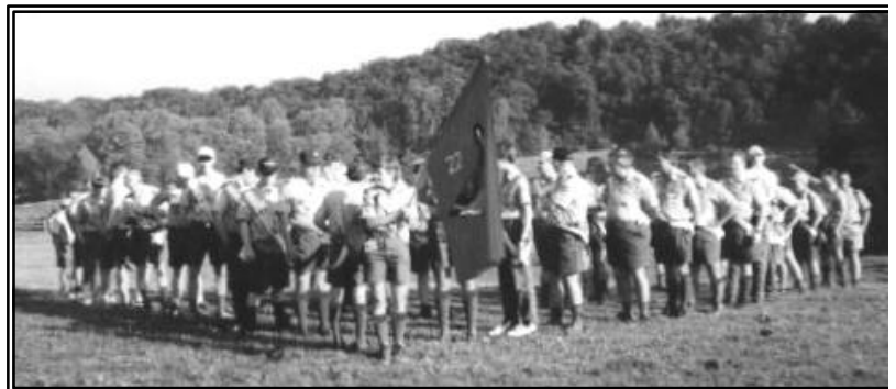
The Octoraro "flock" at morning assembly