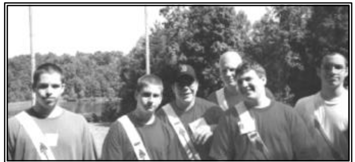
Hanging out instead of going to Training Sessions

One would have to search far and between to find a delegate who did not have a good time. Perhaps it was the near perfect weather, the smooth program, or the excellent facilities that made the 1998 NE-4A Conclave a success. The Section experienced something dramatic also... they got to see the Octoraro spirit and enthusiasm once more. By the end of the weekend, Octoraro had coerced almost every lodge to do cheers in the dining hall. "Cousins", Kittatinny's term for Host Guides, said that we were a great bunch and that they look forward to the next conclave so they can see us again.